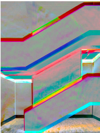
Untitled #4, photography, digital printing, 15.75" x 11.81"