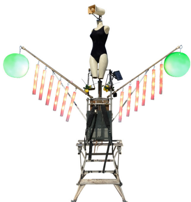
Siren , mixed media/assemblage found objects, (outdoor performance series) kinetic/pedestal - 120 vt plug in, 84" x 96" x 84"