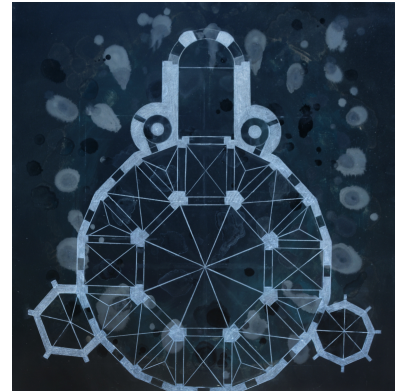
"Cathedral No. II" 52" x 52", mixed media on canvas