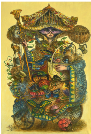
"La vendedora ambulante" 36" x 52", mixed media on canvas

Each artist's work reflects Cuba's current cultural and political concerns, social dynamics and gender issues. Female artists are challenging the meaning of "feminine", by exploring the stereotypical attributes so often applied to them.