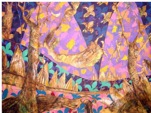
"Angel Nocturno" 36" x 43.5", mixed media on canvas