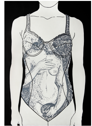
“Untitled” 28” x 36” acrylic on canvas